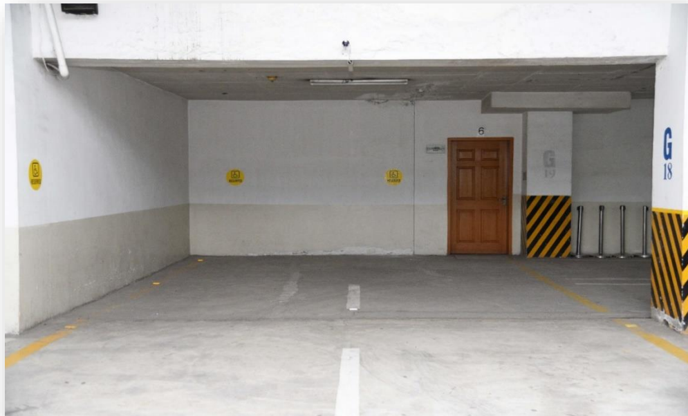
Facilities for the Disables Persons at Campus